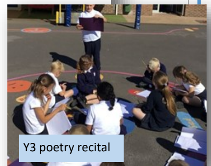
Y3 poetry recital