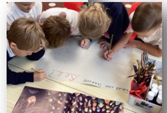
Y2 using adjectives to describe senses

A lluring and angelic is an understatement implying the beauty of this flower is never a debate.