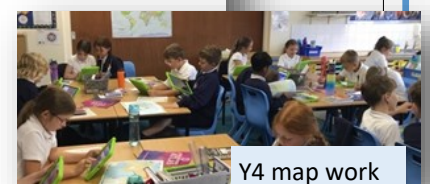
Y4 map work