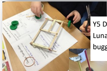
Y5 DT Lunar buggies